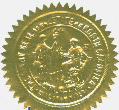
BEVERLY EAVES PERDUE

NOW, THEREFORE, I, BEVERLY EAVES PERDUE, Governor of the State of North Carolina, do hereby proclaim June 21-28, 2009, as “AMATEUR RADIO RECOGNITION AND APPRECIATION WEEK” in North Carolina, and I call upon all citizens to pay tribute to the Amateur Radio operators of our state.